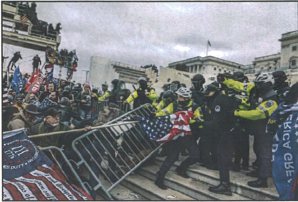
Photograph of the Capitol on January 6, 2021 116