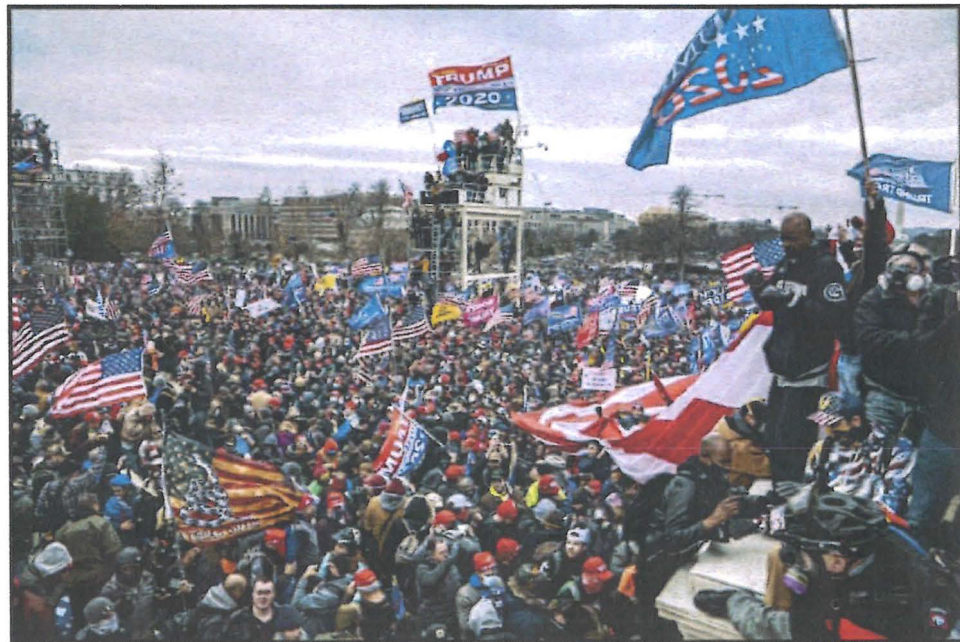
Photograph of the Capitol on January 6, 2021 113