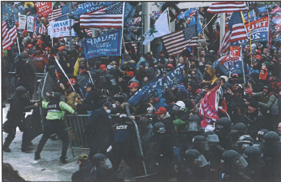
Photograph of the Capitol on January 6, 2021 117