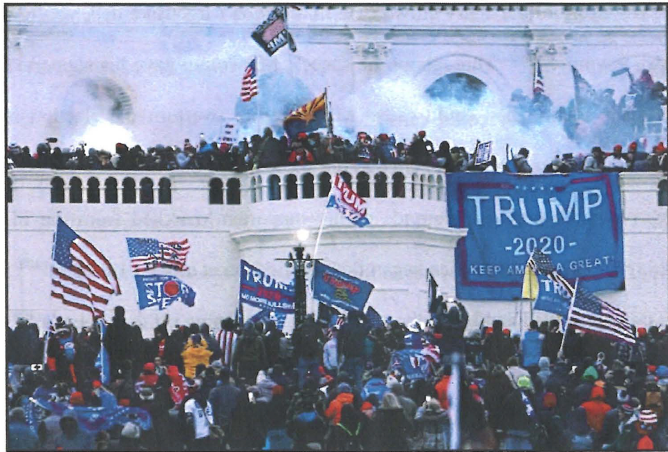
Photograph of the Capitol on January 6, 2021 112