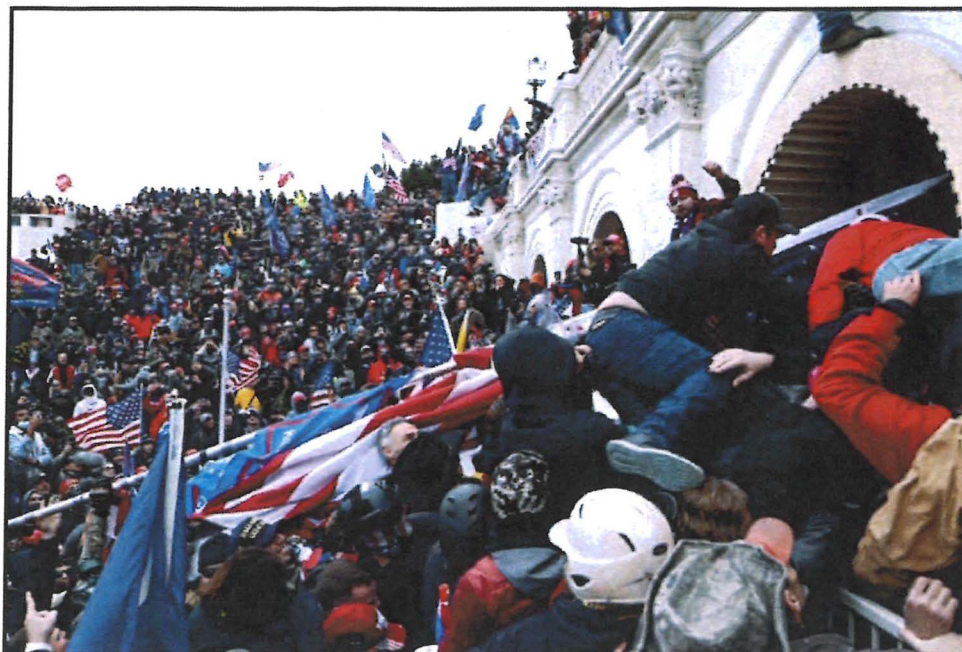
Photograph of the Capitol on January 6, 2021 114