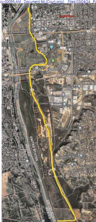
Government Exhibit 2:23-cv-55-AM 2:23-50869 29-52